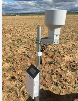
A high-precision rain gauge has been installed on the plot.