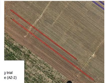
Lines with a density of 20,000 pl/ha