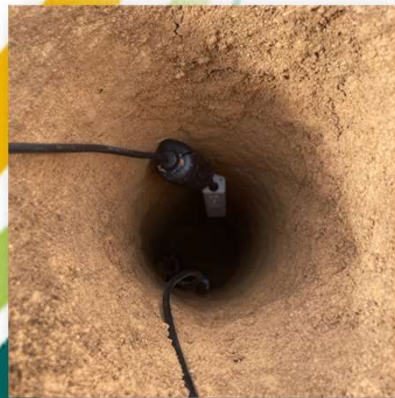
Installation of sensors at two depths (30-60 cm).

Planting of Guayule was carried out in autumn 2023.